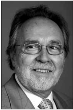
Dick Marty

Interview with Dick Marty *, conducted on 2 October 2015 – the morning show of the French Swiss RTS – “Radio Télévision Suisse”