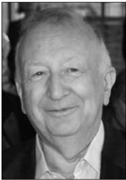
Willy Wimmer

Actually, the UN super summit in New York has passed by much too fast. No wonder certain images had no time to catch the attention of the viewers as they had deserved, drowned as they were in an excess of “refugees welcome” images