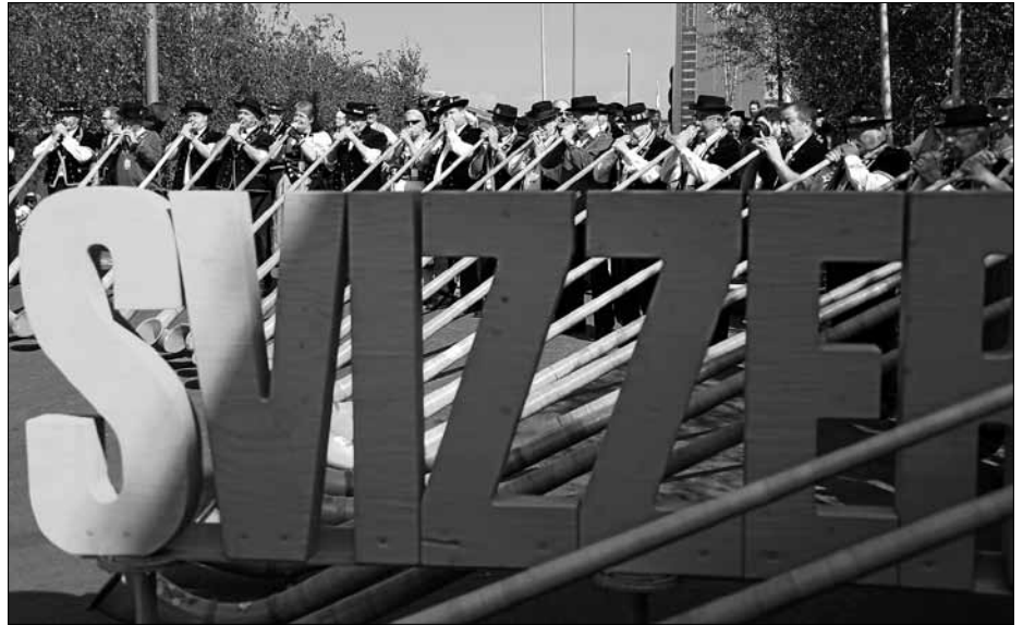
Impressions at an alphorn concert performed at the Swiss Pavillion at the 2015 World Expo in Milan, which will continue till the end of October.

A sound-technically more suitable open-air stage than the Duomo Square in Milan would have been hard to find: In front the sky-striving facade of the Gothic construction wonder as well as the magnificent monumental buildings arranged in a rectangular manner around the square. In this open-air concert hall, open only to the sky, the 425 cult instruments from the Swiss mountains produced a literally ar-