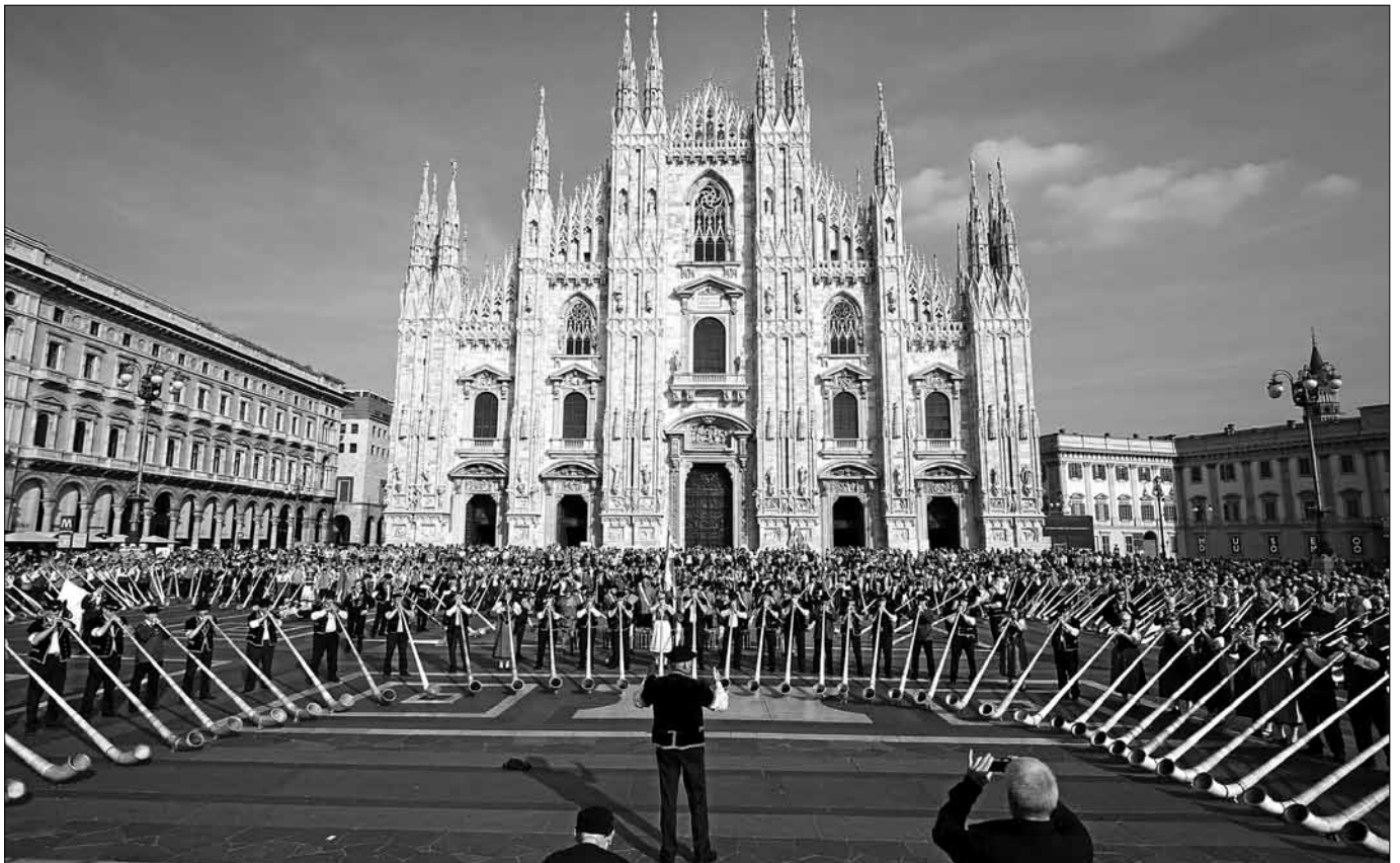
One could hardly have chosen a more impressive open-air stage for a giant alphorn concert due for a listing in the Guinness book of records.

A wooden trumpet mouthpiece facilitates the transfer of vibrations of the lips to the air trapped in the tube of the alphorn. Slow oscillation causes a low tone. The faster the vibration of the lips, the higher the sound of the horn. The audible range of the alphorn is – you will be amazed – 8 km. In order to transport the horn with a length of more than 3 m and a weight of 2-3 kg it can be dissected into three pieces. Most recently, there is the production of greyish black and lightweight carbon horns (10 parts and nearly ½ kg); but they lack the homely effect of timber.