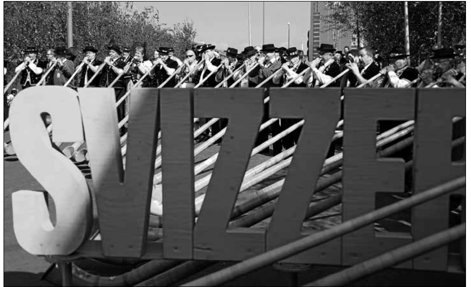
Impressions at an alphorn concert performed at the Swiss Pavillion at the 2015 World Expo in Milan, which will continue till the end of October.

A sound-technically more suitable open-air stage than the Duomo Square in Milan would have been hard to find: In front the sky-striving facade of the Gothic construction wonder as well as the magnificent monumental buildings arranged in a rectangular manner around the square. In this open-air concert hall, open only to the sky, the 425 cult instruments from the Swiss mountains produced a literally ar-